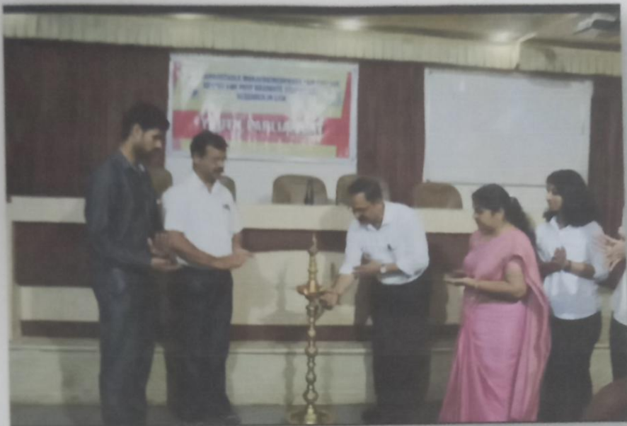
Description for photo 1: Inauguration of Youth Parliament