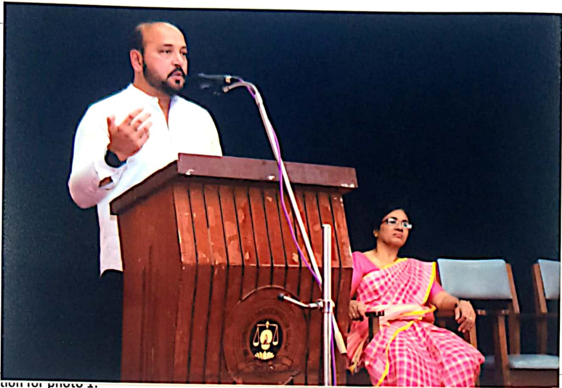
Description for photo 1: