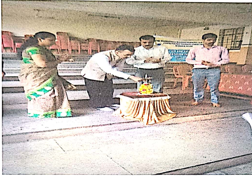
Description for photo 1: Inauguration by lighting the Lamp