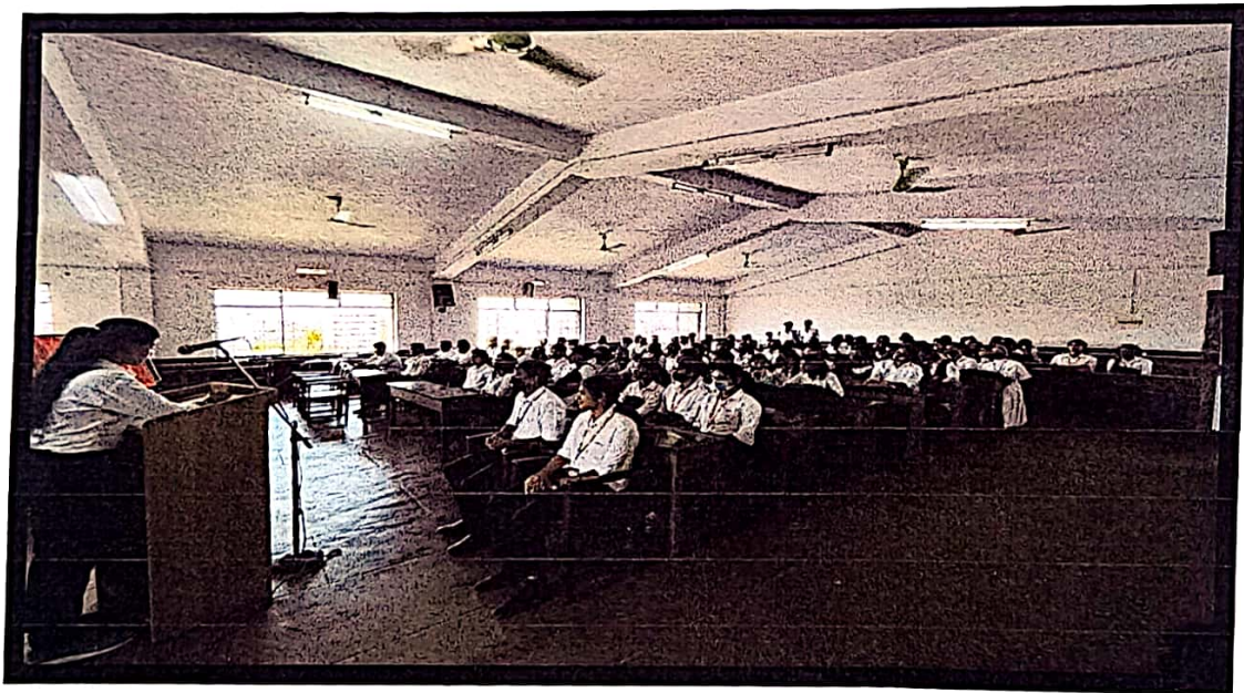
The Students participation .