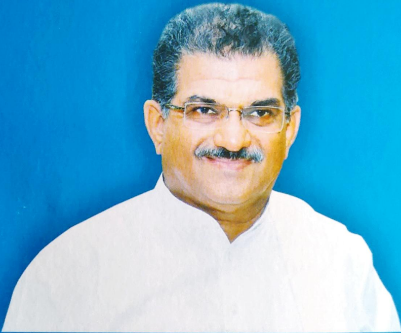
Paramapoojya Dr. D. Veerendra Heggade President, SDME Society ®., Ujire