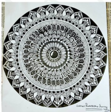
Mandala art by: Lakhan Prathiksha 5(5) BALLB